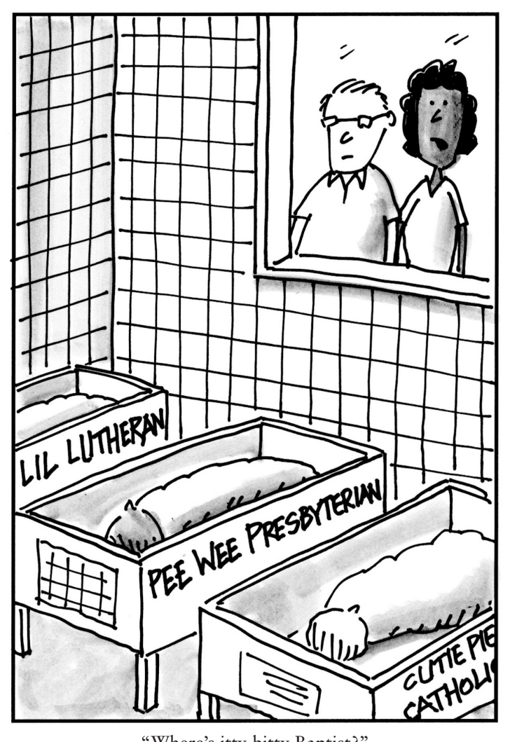
"Where's itty bitty Baptist?"